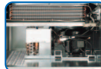
Slide-in/slide-out cooling unit

The Rondò has an extremely sturdy ergonomic product dispensing compartment (patented), an anti-theft device and a slow motion closing mechanism. An optional kit is available which will block the dispensing compartment when the vending machine is not being used. However, when a product is dispensed it will open for a programmable length of time to allow the item to be collected.